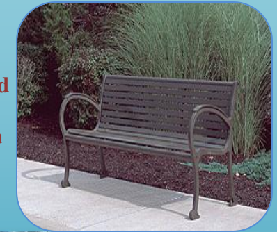
Designated Bench for City Plaza

The City of Watsonville's Parks & Community Services Department will work with the donor to set a date to have the tree or bench installed. The plaque will be guaranteed for 10 years after the date of installation. If a tree or bench is destroyed, the City will replace it within the same ten years.